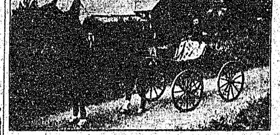
Livery rigs of all kinds. Heavy draying and freight delivery.